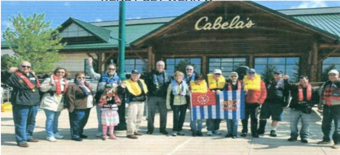
Fox Valley and DuPage