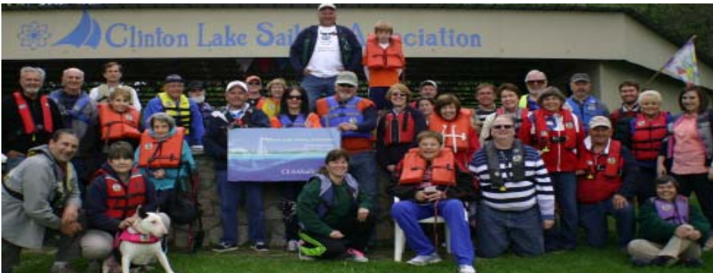
Mid Illini and Illinois Valley